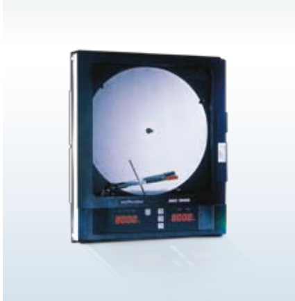
Chart Recorders: for hard copies of all process activities

West Instruments distributes a wide range of Partlow brand digital (microprocessor based) and analogue circular chart recorders. The range provides reliable operation in rugged environments – from light industrial through to extreme industrial wet applications to industry specific flow and relative humidity applications.